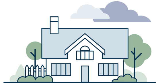
TRADITIONAL “LAND/LEASE” COMMUNITIES

In “purpose-built” communities, such as planned unit developments or condominiums, private manufactured home community operators may build a large community from the ground up with the intent of offering long-term leases to tenants. Large and well-respected manufactured housing community ownership companies, such as YES! Communities, are known to have been involved in the construction and ongoing management of homes sited in long-term leasehold parks outside of the greater Denver, Colorado, metropolitan statistical area.